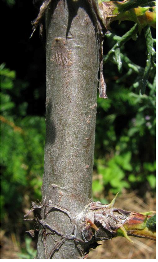
Fig. 2 : Cupressus revealiana, cultivated.