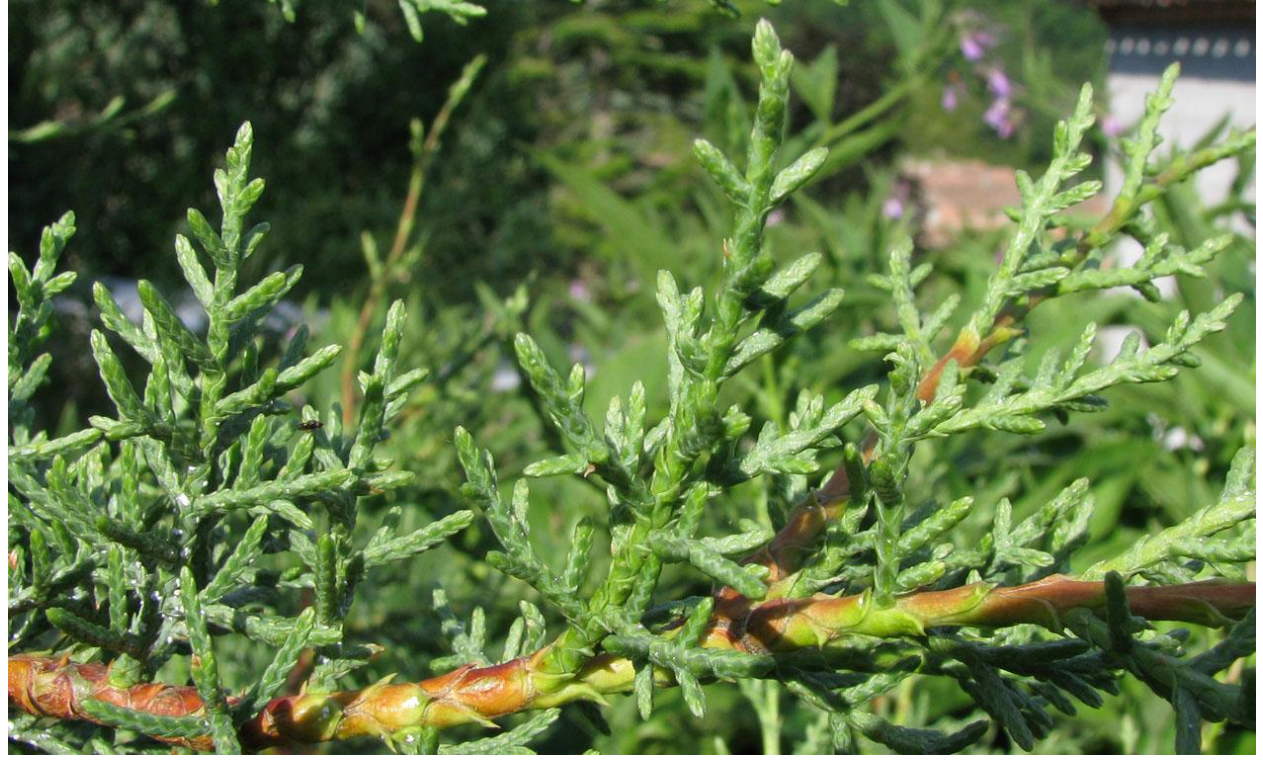
Fig. 5 : Cupressus revealiana, cultivated, branching pattern of ultimate shoots

Figure 3 was drawn from actual shoots. The following photos show these branchlets. Fig. 4 : Cupressus stephensonii , cultivated, branching pattern of ultimate shoots.